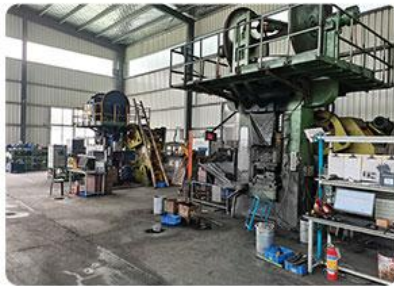
400 ton friction press