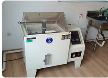
Salt spray tester