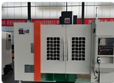
Work center three axis