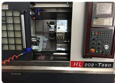
Oblique rail CNC lathe