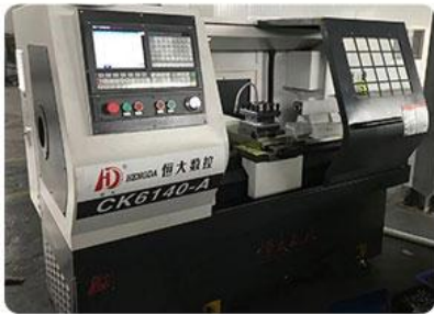
Flat rail CNC lathe