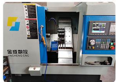
Small CNC lathe