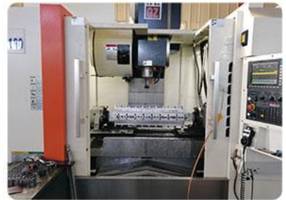
Four axis center